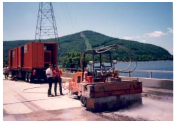
The Concrete Buster seeks out and removes delaminated concrete.

Above production rates are based on contractor experience. Production rates may vary subject to aggregate size, compressive strength of concrete, number of rebar and size of rebar.