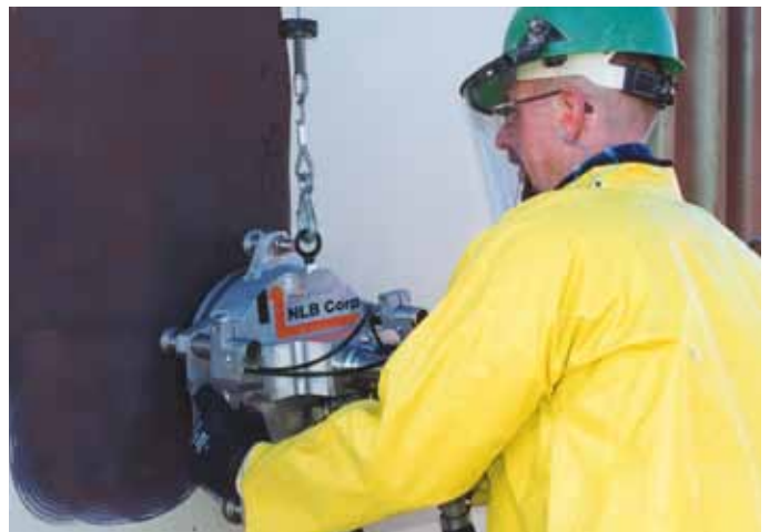
NLB's HydroPrep™ line of surface preparation tools reduce environmental impact and eliminate the need for containment.

All Units Are Factory Tested Before Shipment