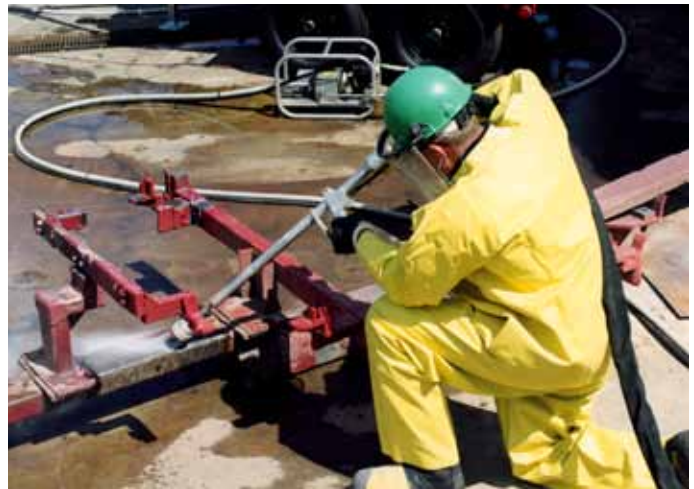
Paint removal for automotive skids using the NLB Model NCG8450A-3 rotating hand lance.