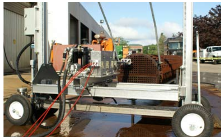
The powerful lance drive system makes changing hoses as easy as opening the enclosure, taking the old lances out, and putting the new lances in. No belts or paddles to change, and no adjustments are necessary.