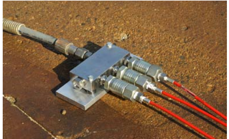
The Saflex-3000 can run up to three separate flexible lances at the same time.

Specifications subject to change without notice